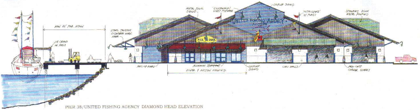
PIER 38/UNITED FISHING AGENCY DIAMOND HEAD ELEVATION