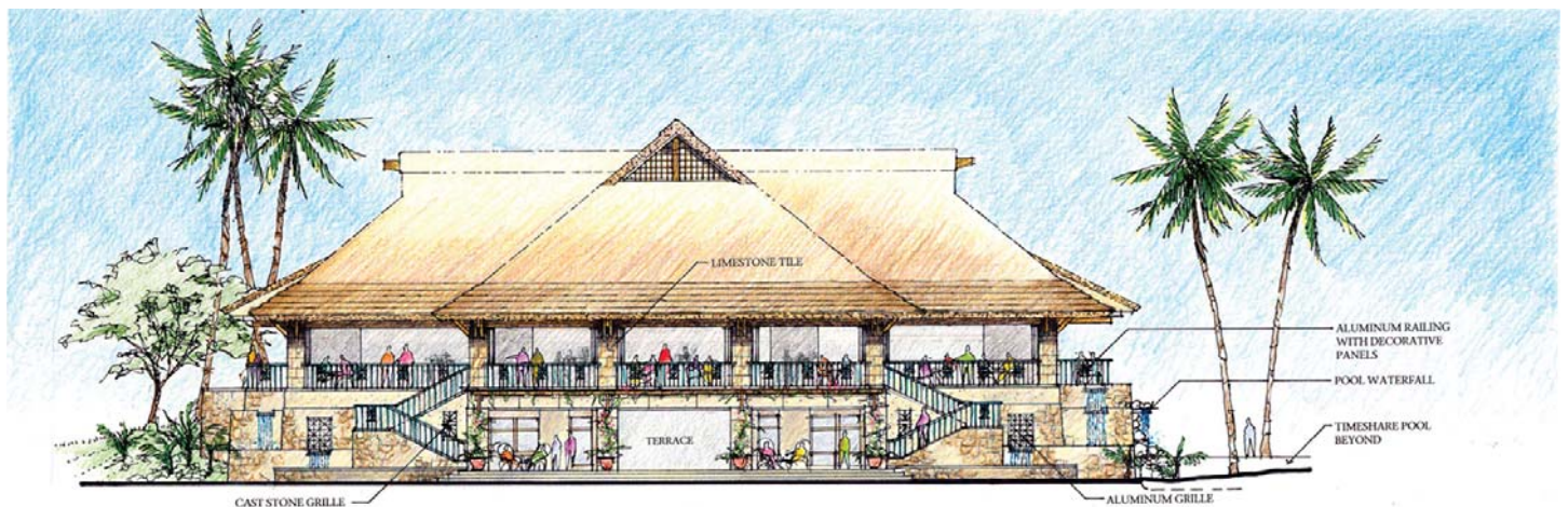
Clubhouse Ocean Side Elevation